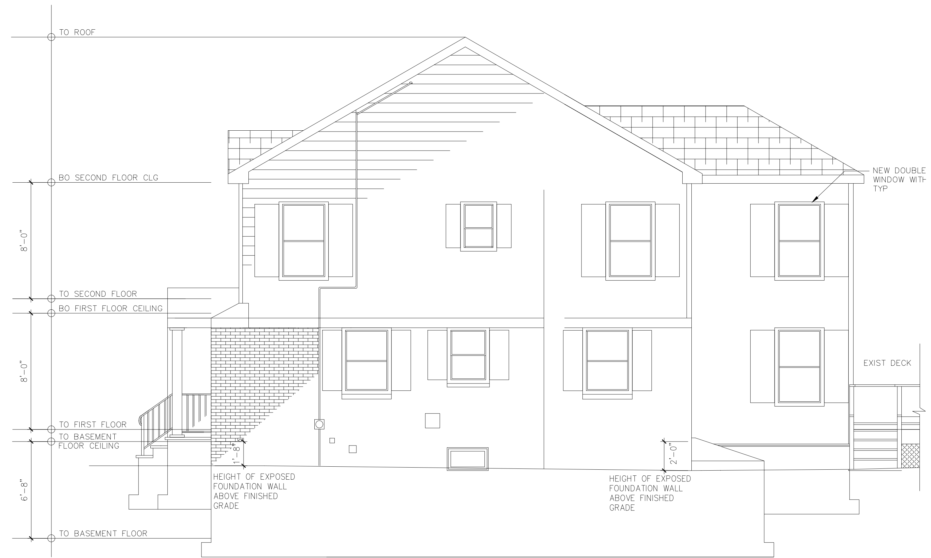
B NEW RIGHT SIDE ELEVATION A-03 SCALE: 1/4" = 1'-0"