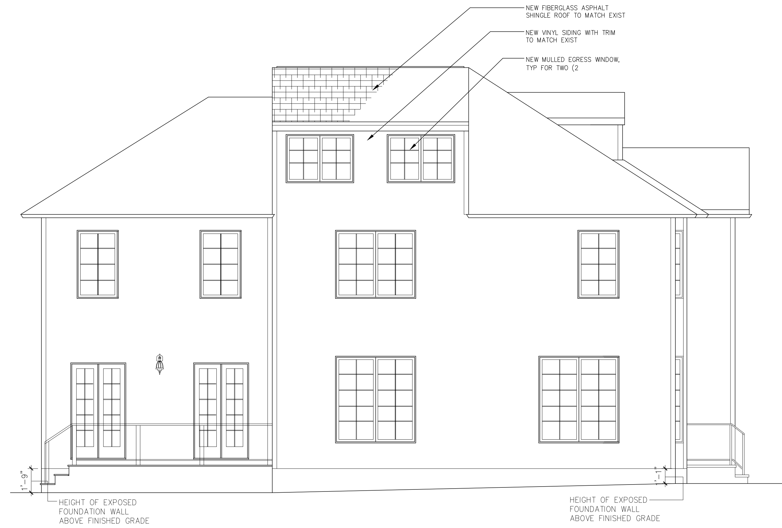
D NEW LEFT SIDE ELEVATION A-03 SCALE: 1/4" = 1'-0"