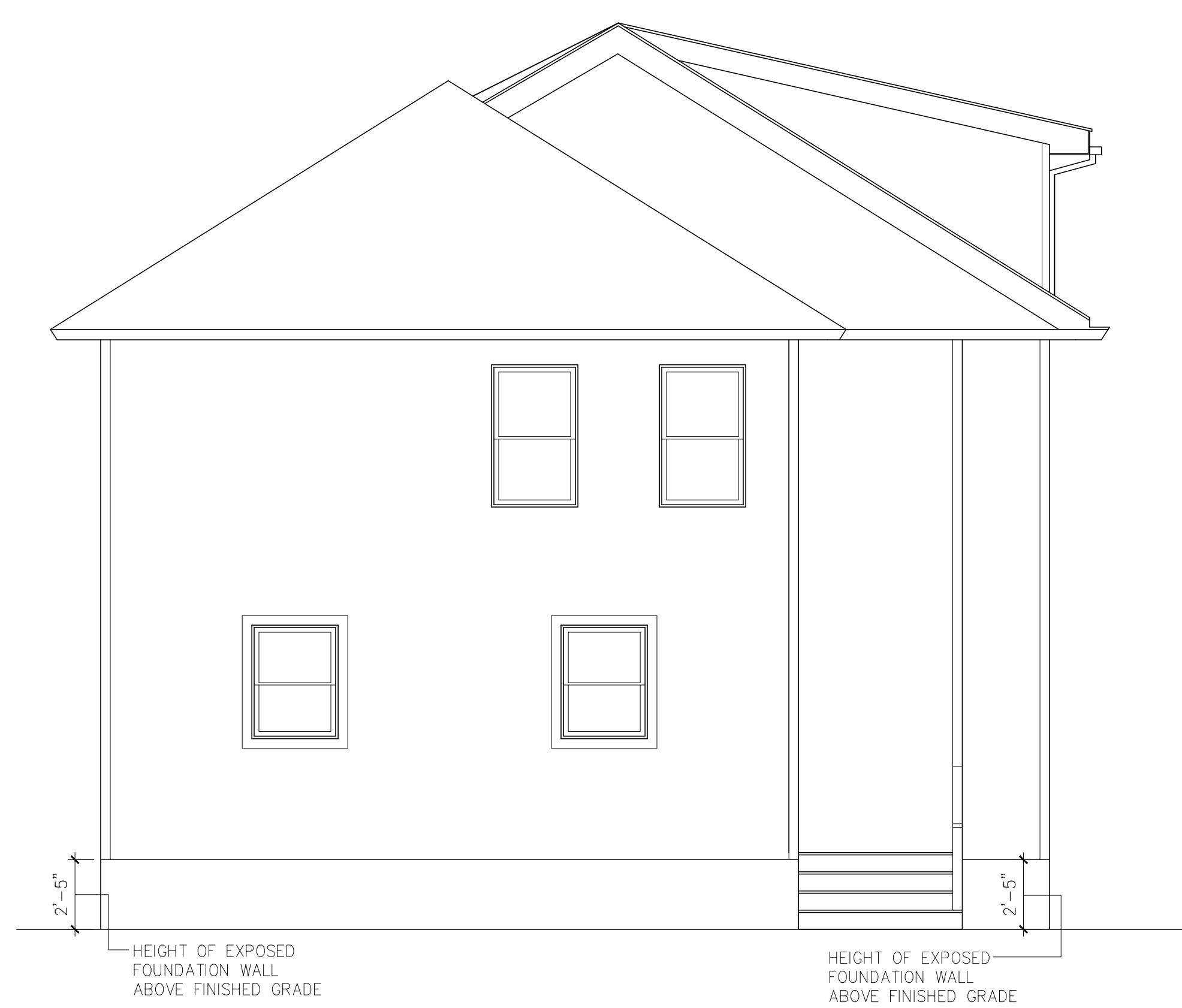
C NEW REAR ELEVATION A-03 SCALE: 1/4" = 1'-0"