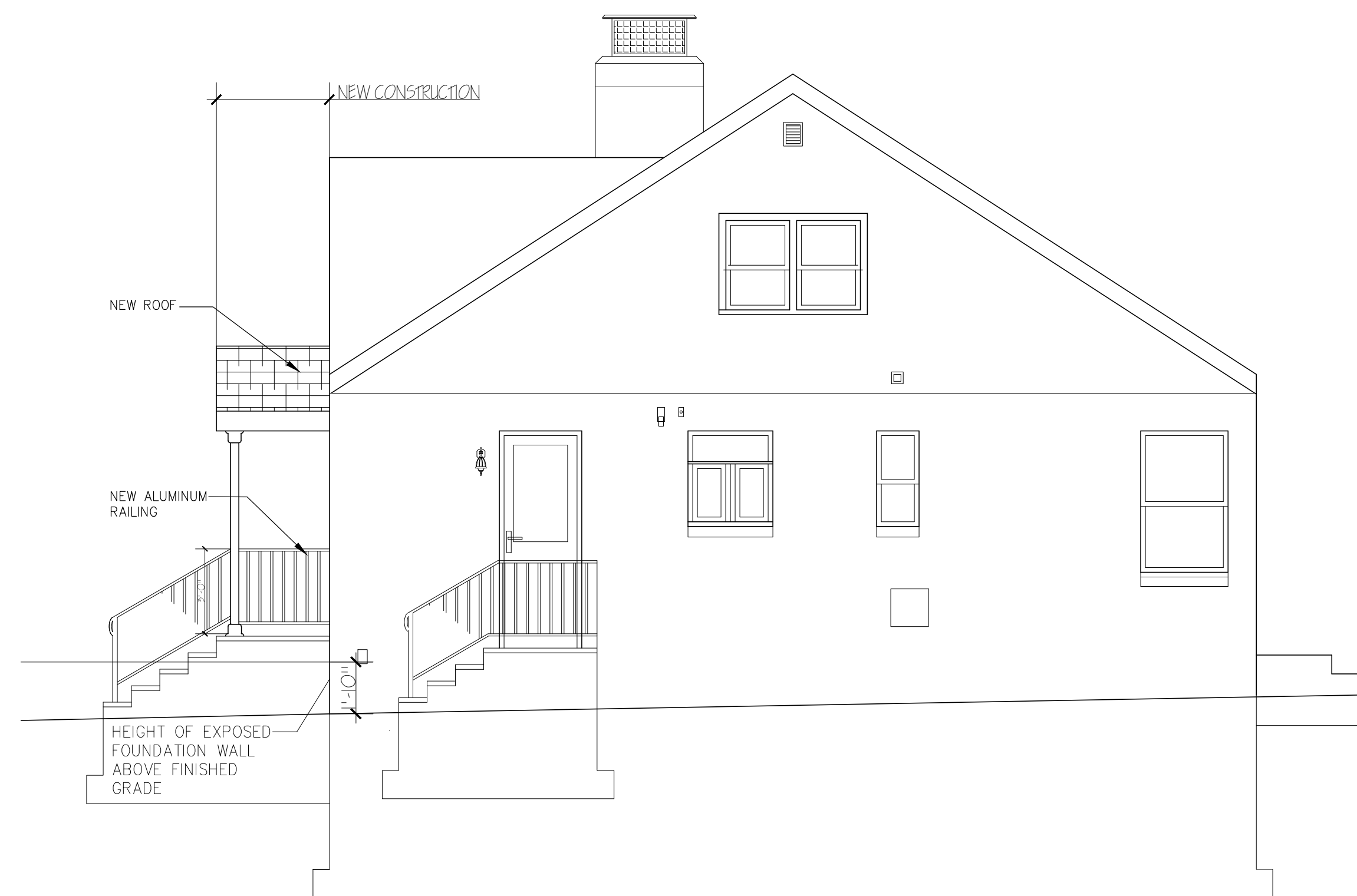
B NEW RIGHT SIDE ELEVATION A-03 SCALE: 1/4" = 1'-0"