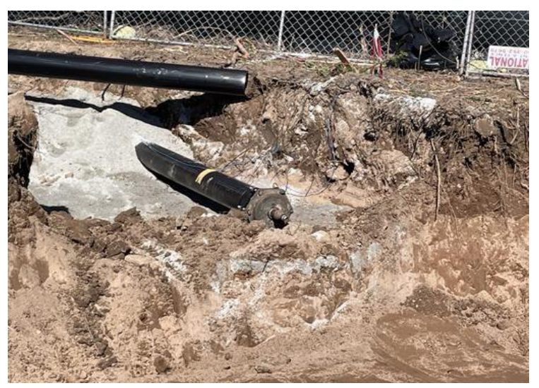
Water Line Pipes at the New Treatment Building