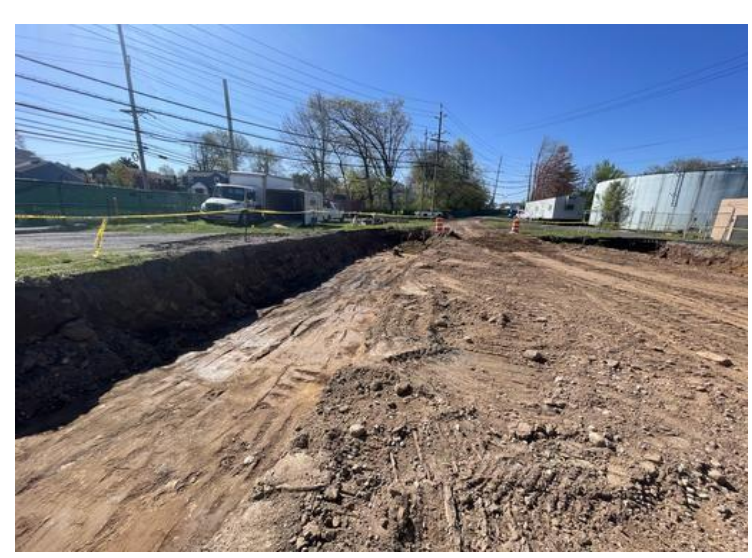
Building Foundation Excavation