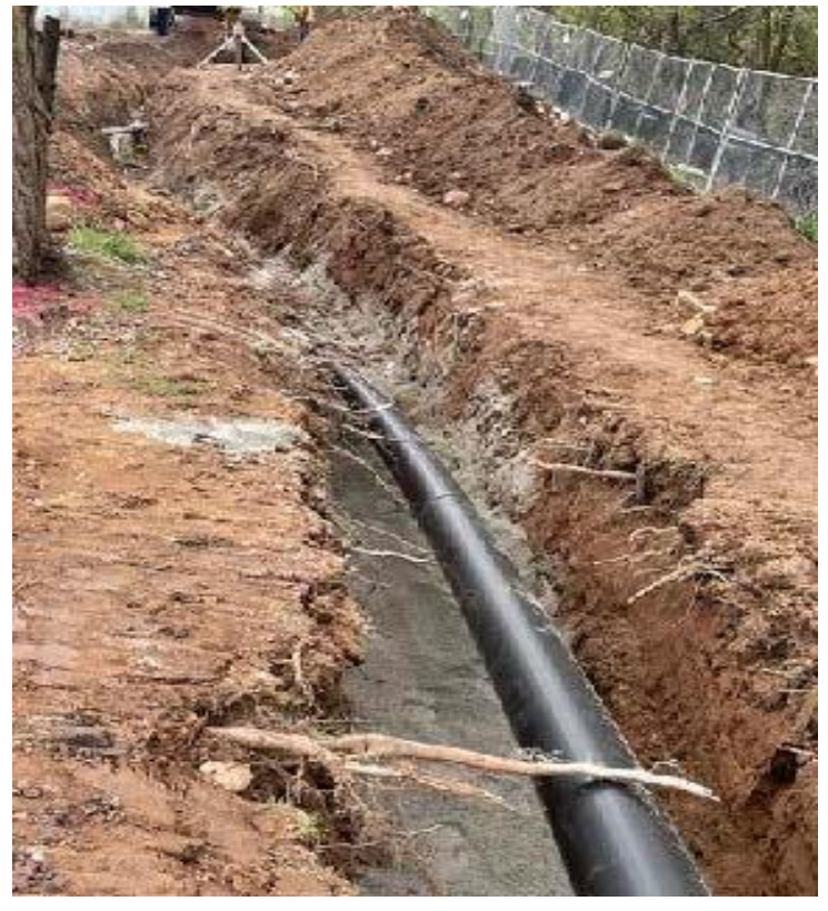
Clean Water Pipe Installed Underground