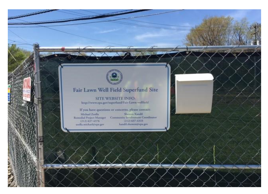
Project Site Information Sign and Mailbox