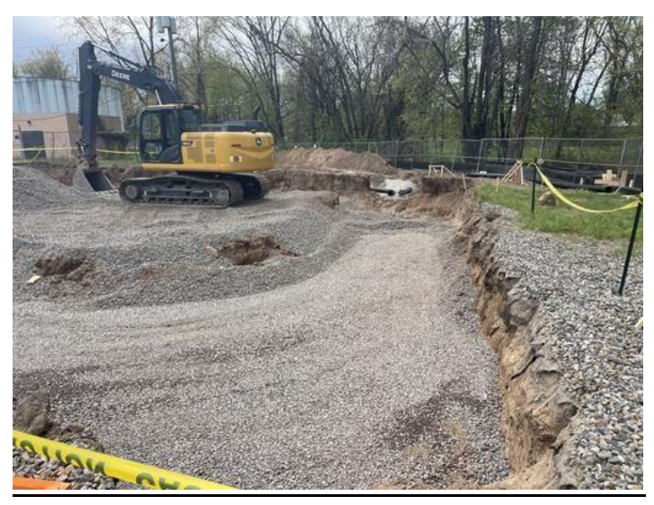
Foundation Base Back filled with Crushed Stone