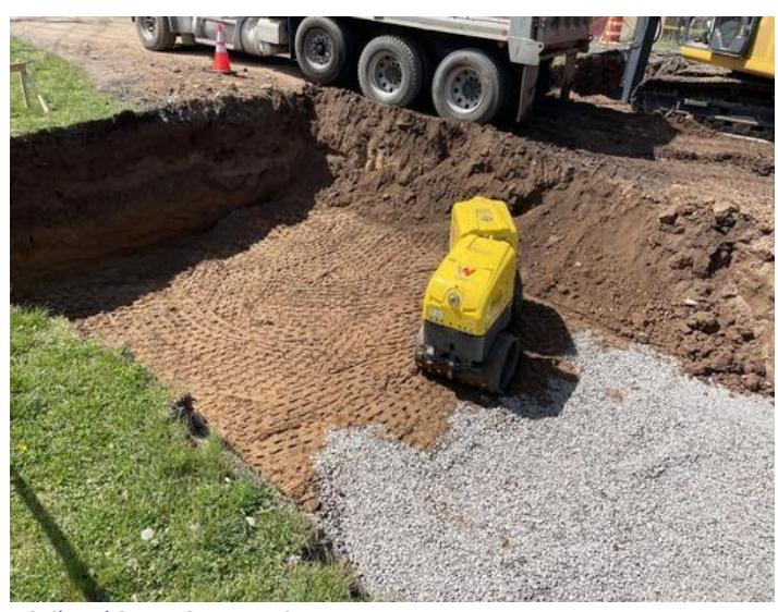
Soil and Stone Compression